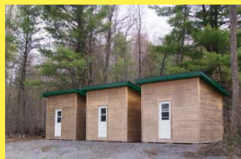
3 person cabins